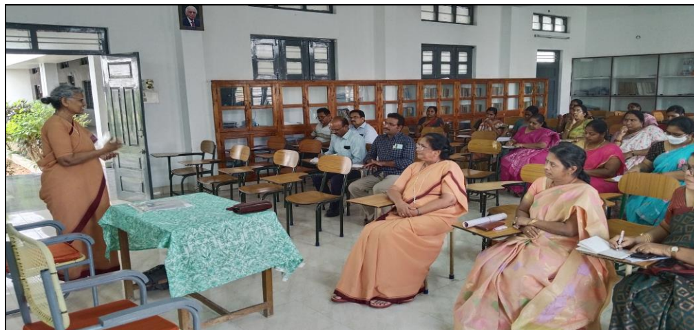
Principal and staff in the Programme